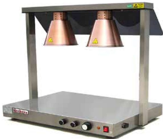
mod. LH 2

Base temperature controlled from 30~80 °C Lamps with separate function Lampshade screen copper color Lamps 250 W included