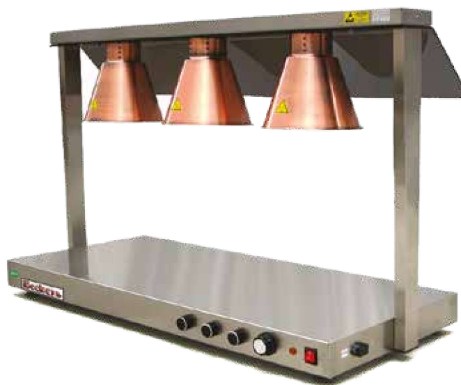
mod. LH 3